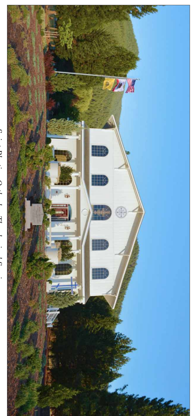
Saint Photios Orthodox Theological Seminary